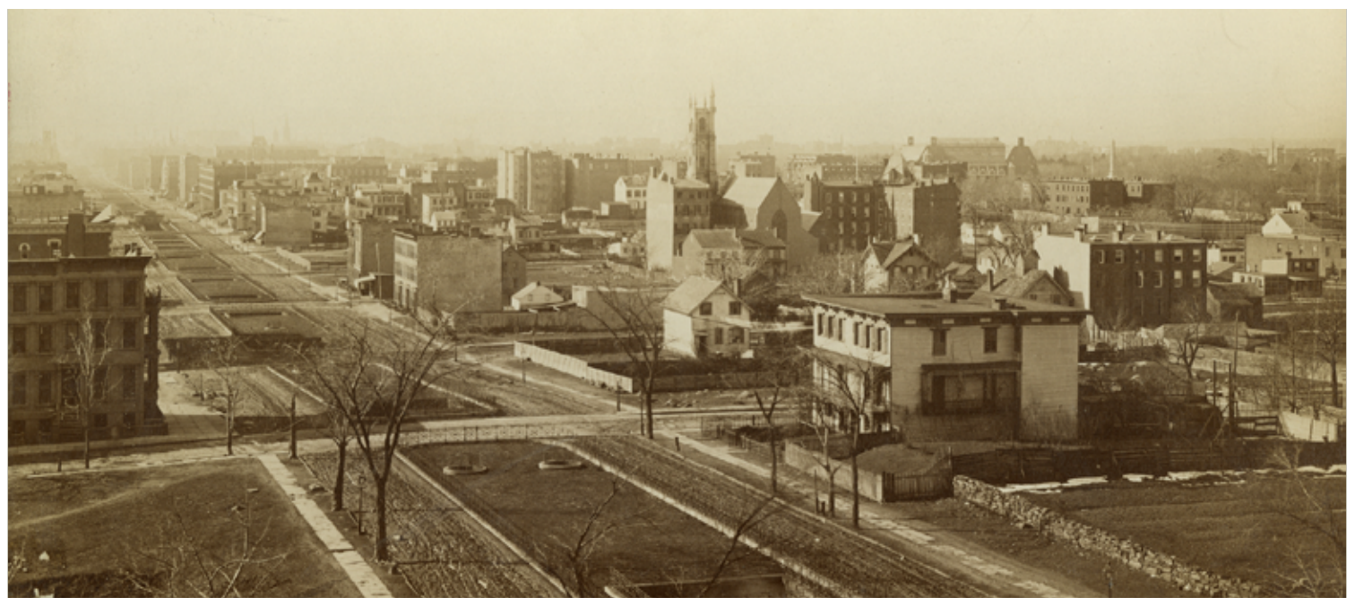
A Panorama from Park Avenue and 94th Street, 1882–83 (Detail) [Link]